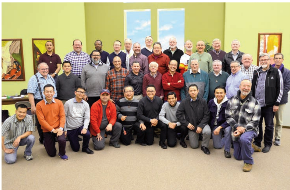
Participants in the US Provincial Conference: "Our Future: Together in Community and Ministry"