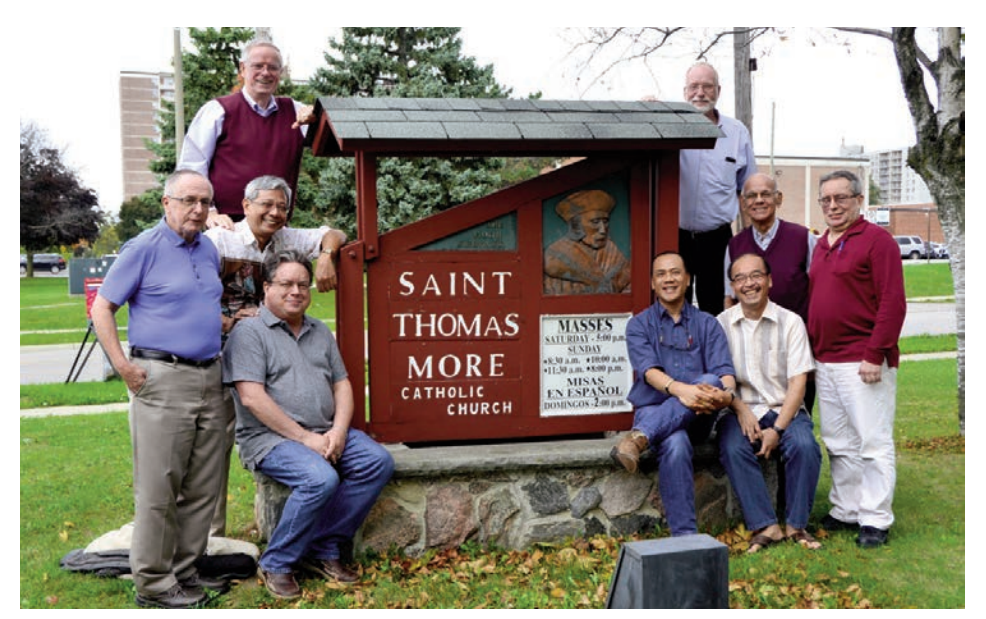
The administrations of the US Province and Canadian Region following their meeting near Toronto

Collaboration, not just cooperation, has been a growing theme in these joint gatherings. The next meeting of the North American administrations will take place May 15 in Hales Corners, Wis.