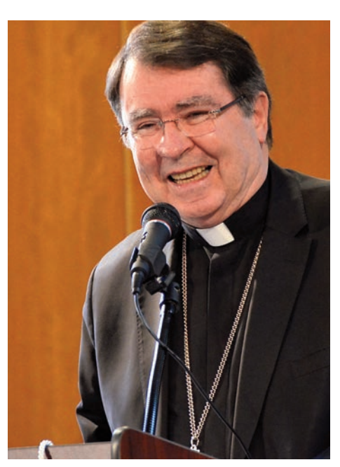
Archbishop Christophe Pierre speaking at the October Dehon Lecture at SHSST.

Catholic priests. "This integrated formation prepares the seminarian and priest to make a gift of himself to the Church – to go out of himself, to not be self-referential but to look to the essential needs of the flock," said the archbishop. "Indeed, the Holy Father wishes priests not to be managers or mere functionaries of the sacred, but rather to be priests with inclusive and compassionate hearts, who show forth the tenderness of God."