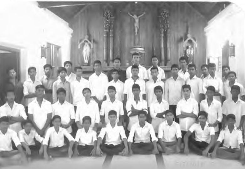
Students of Dehon Bhavan Kumbalanghy, Ernakulam