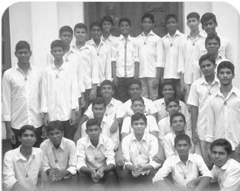
Students of Dehon Prema Nilayam, Gorantla, Guntur