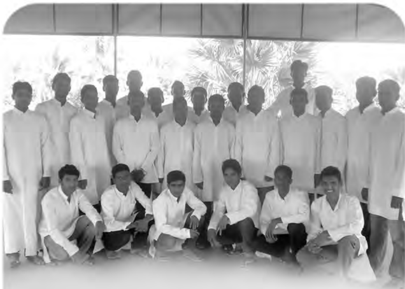
Students of Dehon Vidya Sadan, Aluva, Ernakulam