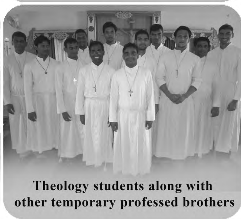
Theology students along with other temporary professed brothers